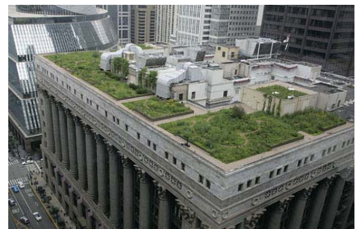
The green roof atop Chicago's City Hall demonstrates the City's commitment to sustainability.

Partnerships are at the center of making this new program work. WARM will be partnering with the Michigan Suburbs Alliance, SEMCOG, the Michigan Municipal League, the US Green Building Council and others to help Detroit and other cities in the region tackle how to make green work for their circumstances.