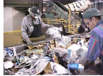
Sorters at the SOCRRRA Facility

For the 1,104 homes in the pilot areas, this results in 60,000 lbs of additional recycling per year, earning more money for the organization.